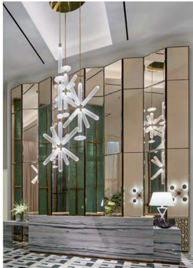
SLS LUX Brickel / Miami