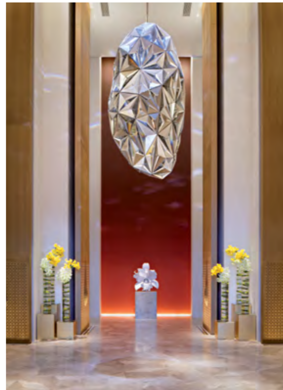
Four Seasons / Kuwait

Collections of lighting, home & décor and monsters