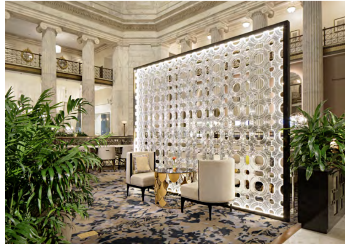
Lasvit Crystal Wall / The Ritz-Carlton Philadelphia