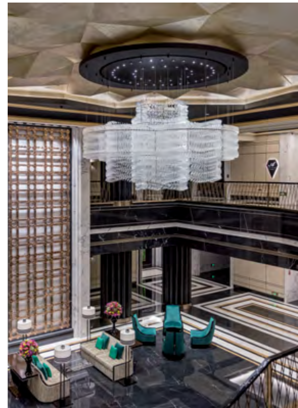
Bellagio / Shanghai