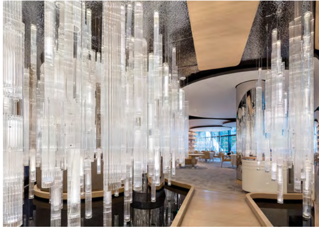
Alain Ducasse Restaurant at Morpheus / Macau