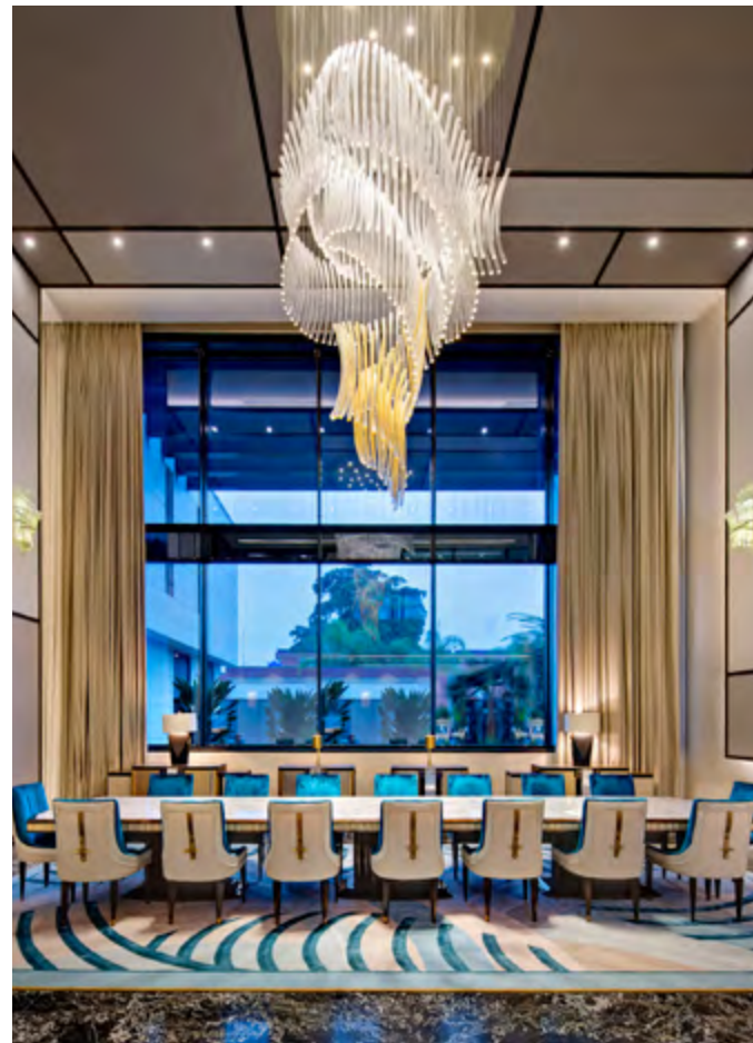
Private Residence / Lagos