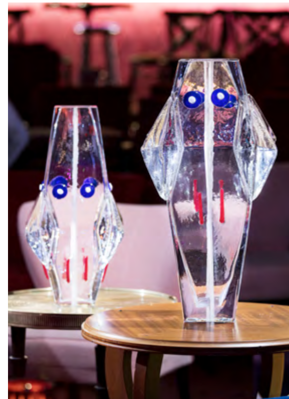
Monster Collection / Rombo by Alessandro Mendini