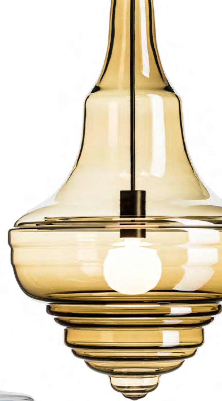
Neverending Glory Pendant Bolshoi Theater Medium CL008PK Dimensions / Dia 413 x H 560mm + L Dia 16 1/4" x H 22 1/16" + L Weight / 8,4kg / 18,6 lb Packed Product Measurements / 490 x 490 x 590mm 19 5/16" x 19 5/16" x 23 1/4"