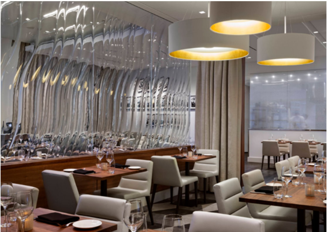
Lasvit Liquidkristal / Sophie's Chicago

Collections of lighting, home & décor and monsters