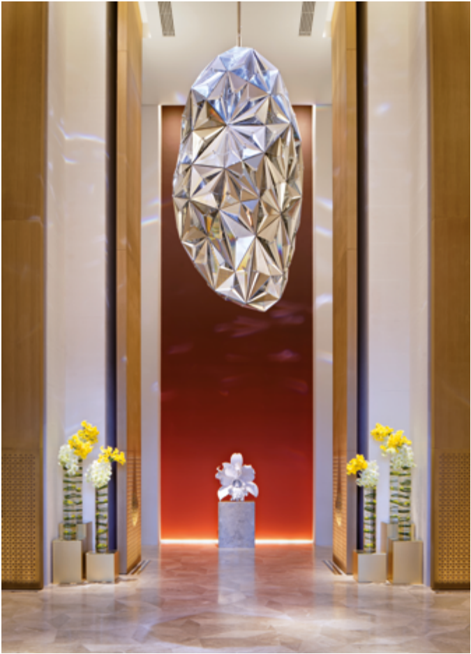
Four Seasons / Kuwait

Collections of lighting, home & décor and monsters