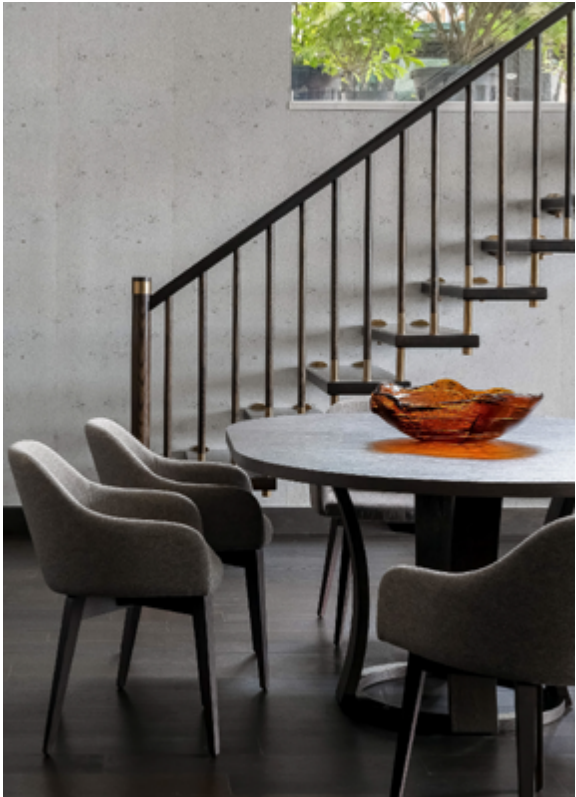
Home & Décor Collection / Candy by Campana Brothers