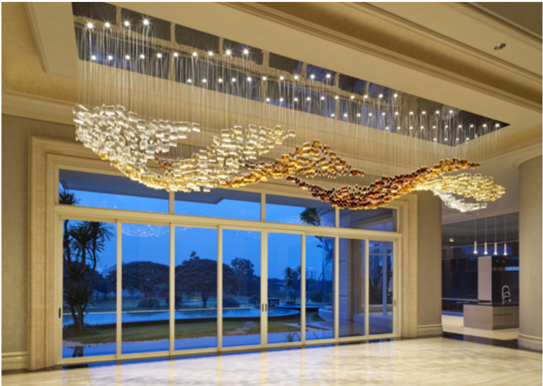
Private Residence / Surabaya