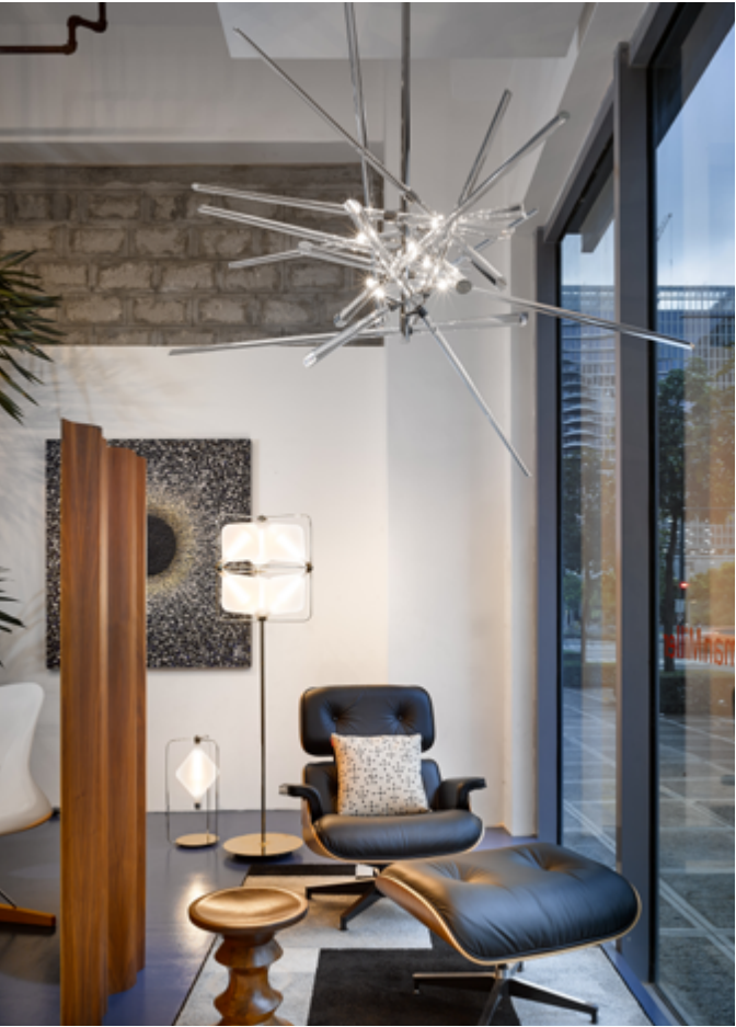
Lighting Collection / And Why Not! by René Roubíček