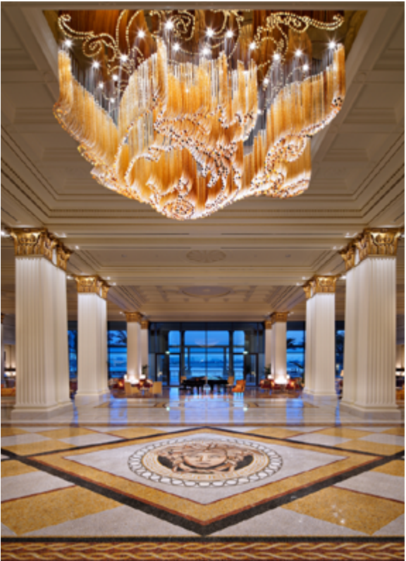
Palazzo Versace / Dubai